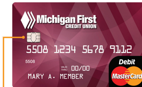
New EMV technology.

Additional information will be provided to you as we get closer to replacing your card(s). If you have questions in the meantime, please stop by a Michigan First branch office, or call 365 Live, our 24/7 call center at 800.664.3828 .